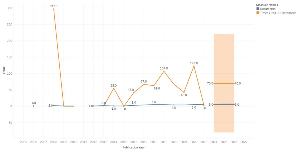
Figure 2. Historical and forecast